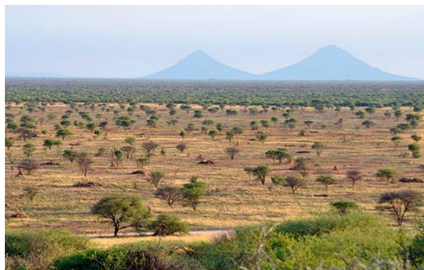
Contrast between rangeland with regular bush control (front) and intense encroachment by woody species (back) in central Namibia.

Bush encroachment occurs in most regions of Namibia, affecting different ecosystems and land uses. This makes it a complex problem. Impacts can vary, depending on the surrounding environment (e.g. types of soil, other vegetation, wildlife), how the land is used and could be