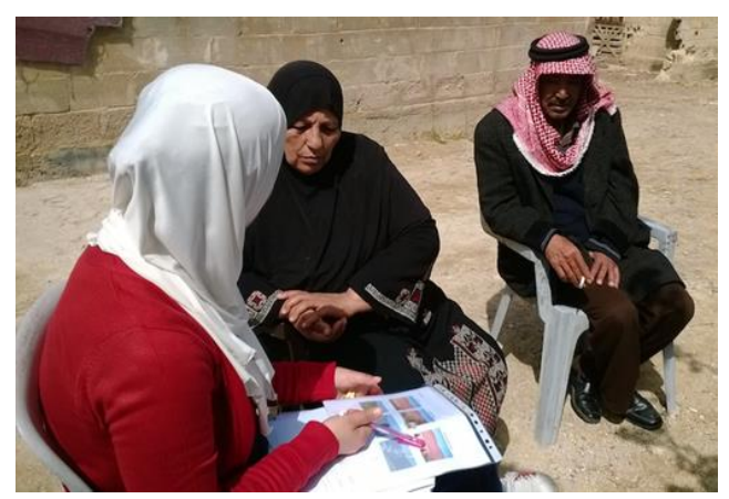
Survey implementation in the Bani-Hashem community, March

Although this study shows that rangeland restoration is highly cost effective, the true potential for rangeland rehabilitation might be still under-estimated by solely looking at the Hima approach. Further research is needed to evaluate the costs and benefits of combining this approach with other technologies or approaches for rangeland rehabilitation.