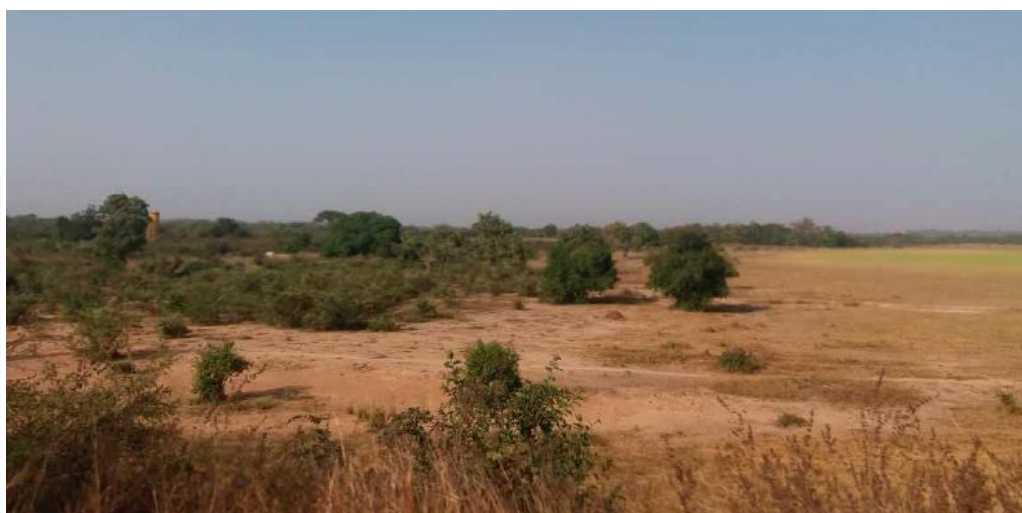
Degradation affected site