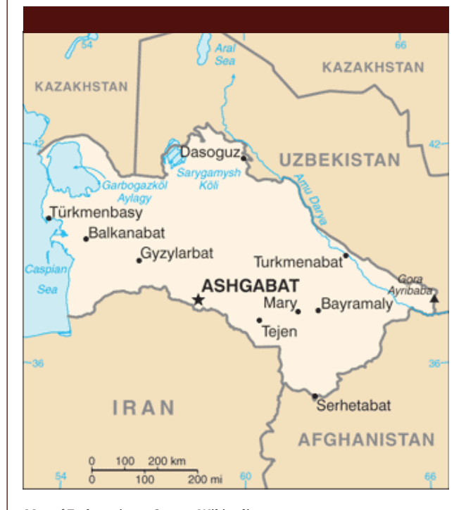
Map of Turkmenistan.

Per capita GDP has been steadily increasing, and in 2013 amounted to USD 18,596. This is partly due to a national emphasis on economic modernisation and diversification, with a combination of market elements and state regulation. The 'intellectual sphere' education, science, health, culture, and social sector, and the development of fuel, energy, and agricultural industries have been the main priorities. In terms of agricultural activity, the production of animal husbandry products remains the dominant focus. More than 80 per cent (38 million hectares) of the land are pastures with year-round grazing by domesticated animals belonging to agricultural enterprises and households. As a result, livestock production is one of the major priorities of both the government and the people. According to FAO statistics, in 2008 there were 18 million heads of cattle.